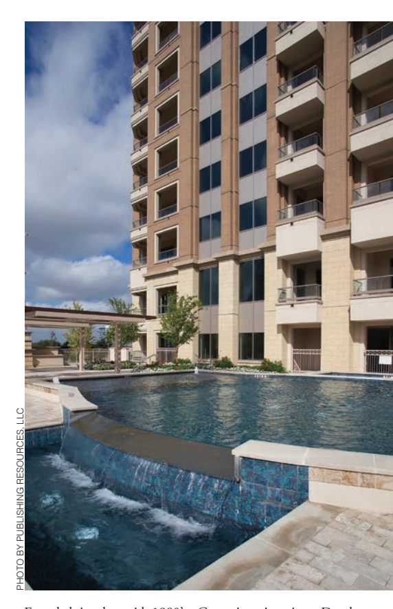
Founded in the mid 1980's, Centurion American Development Group is one of the largest residential developers in North Texas. Specializing in creating affordable communities, today Centurion has over 30 Active Developments all across the region.